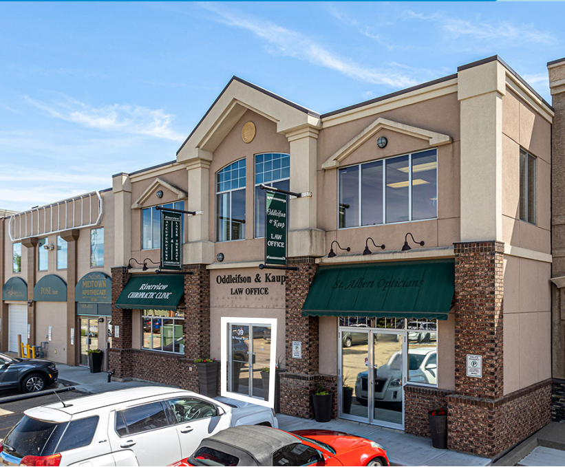
St. Thomas Street