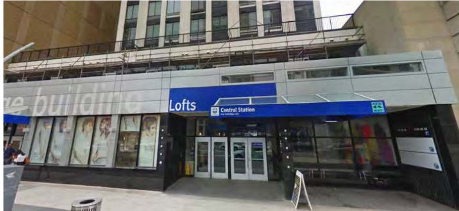
*Entrance located inside